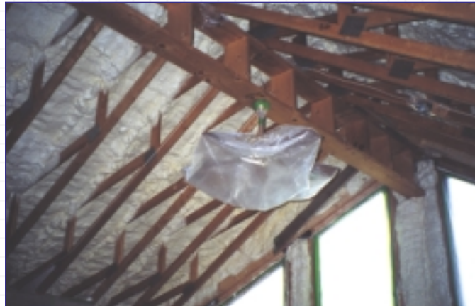
Icynene® is sprayed to a depth of 5 1/2 inches and adheres directly to the roof deck.