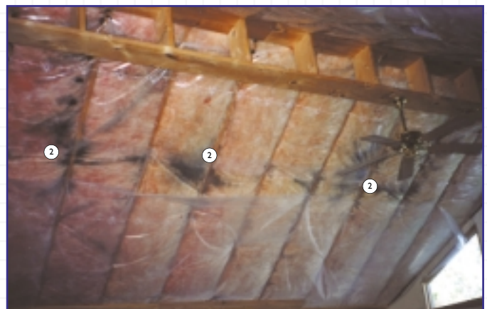
(2) Hot humid interior air had leaked past the poly, through the batt insulation, and come into contact with the cold air in the venting, thus causing condensation and mold.