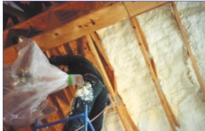
Icynene® is sprayed directly on to the roof deck. There are no air vent channels.

The remaining portion of the attic floor space, approximately 576 sq. ft., was left intact with the original R40 fiberglass batt insulation.