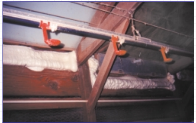
Sealing of the side wall gaps/cracks with Icynene® to prevent air leakage.