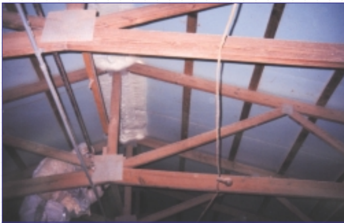
Sealing of the ridge vent with Icynene® Insulation to prevent air leakage.