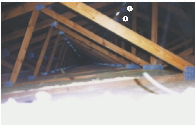
(1) Cracks in the ridge vents allow air leakage into the poultry house.

The University of Georgia's College of Agricultural and Environmental Sciences conducted a study on a broiler farm to demonstrate the effects of air sealing and improved house tightness. The study was conducted on a farm with two 40' x 400' broiler houses. The amount of air leakage was estimated by conducting a static pressure test. The side wall and tunnel inlets were closed, then one 48" fan was turned on and the static pressure was measured. The static pressure created by the one 48" fan was found to be approximately 0.03" in both houses (as measured by the vent opening), indicating that there was well over 20 square feet of leakage in each house.