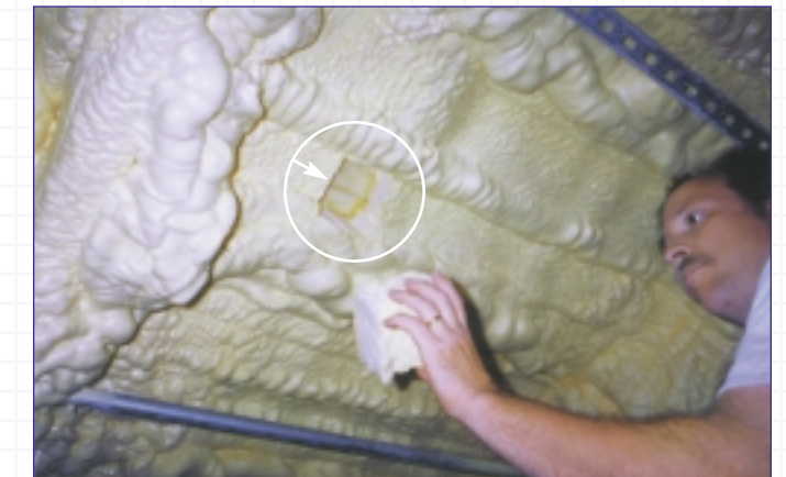
Wendell Porter demonstrates how the Icynene® insulation is cool to the touch and prevents the metal roof deck from heating the interior air. On this June day, the exposed metal roof deck demonstration area was too hot to touch.