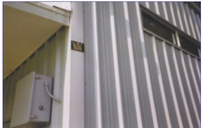
The building utilized standard corrugated steel panel construction.

This project was a collaborative effort between the University of Florida/Energy Extension Service (UF/EES), the Florida Solar Energy Center (FSEC), and the University of Florida/Soil and Water Science Department.