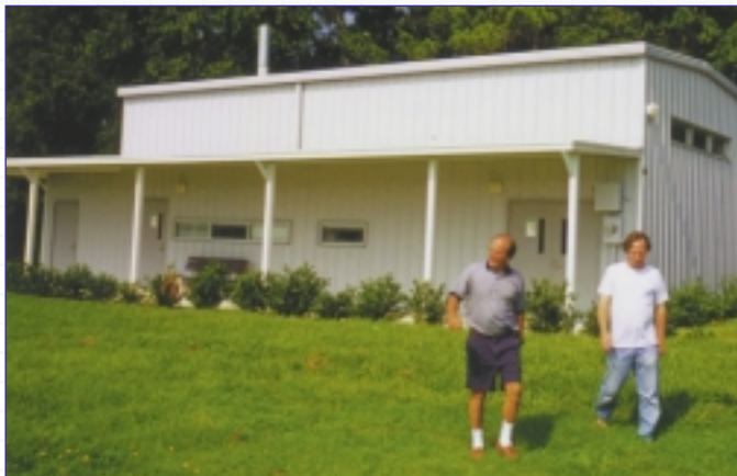
Building 243 at the University of Florida.

The building envelope for this laboratory was a typical commercial steel panel style construction. Controlling air infiltration in this type of structure is difficult at best.