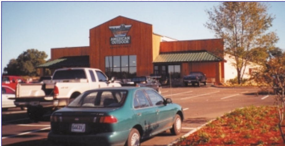
American Outdoor Adventures has 15,200 sq. ft. of retail and office space in Albany, Georgia.