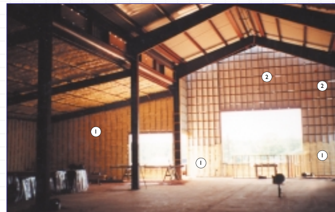
Icynene® installed into the exterior wall cavities, prior to the installation of drywall. (1) Icynene® sprayed area, (2) unsprayed area, note the gaps where air can freely pass through the wall. Daylight highlights these gaps.